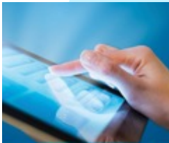
CitiDirect BE® Mobile