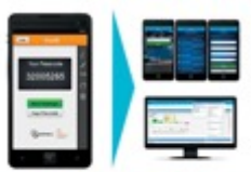
CitiDirect BE® Aplikacja MobilePASS